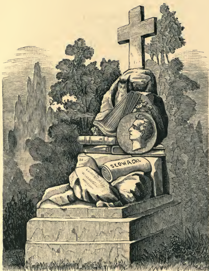
SŁOWACKI'S MONUMENT IN PARIS (FRANCE).